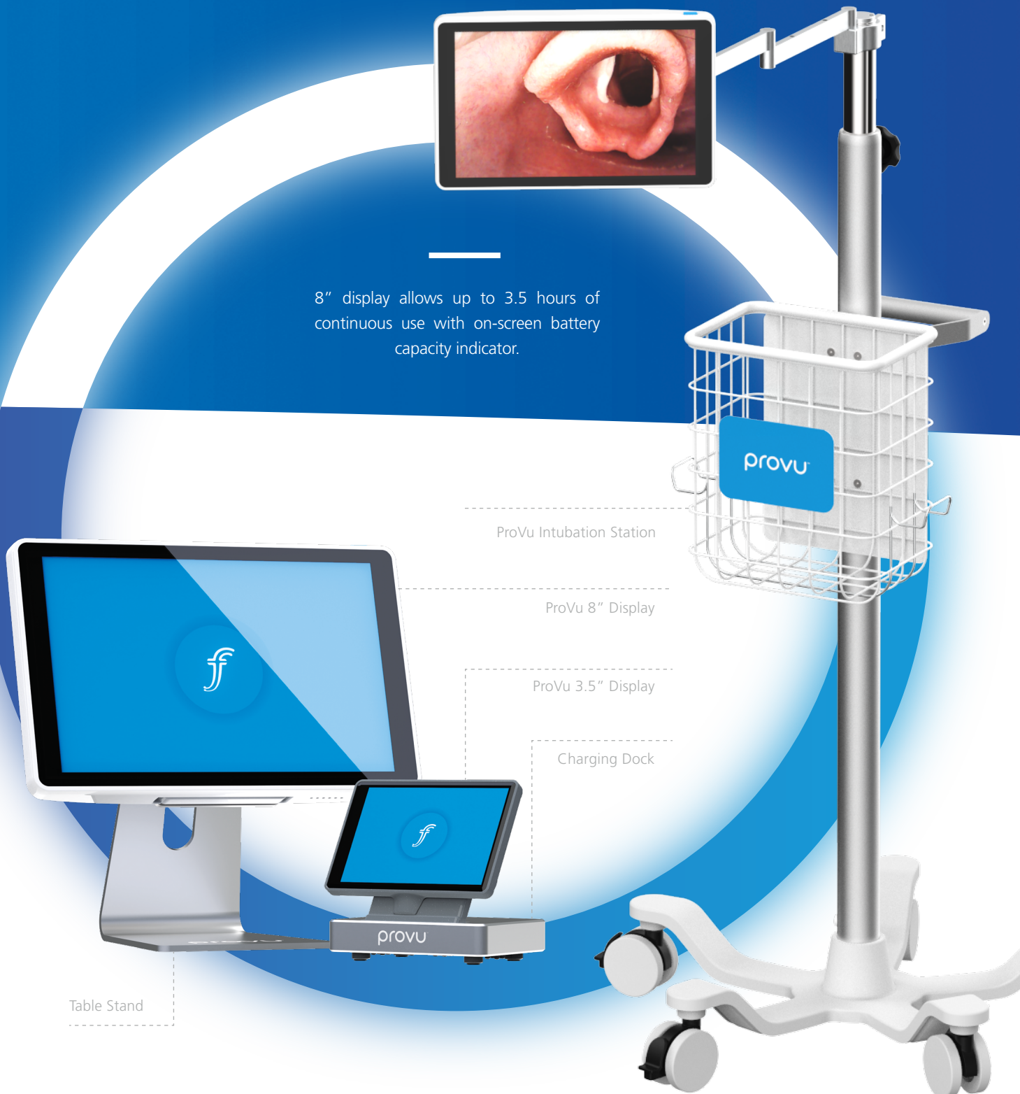
ProVu Intubation Station

8" display allows up to 3.5 hours of continuous use with on-screen battery capacity indicator.